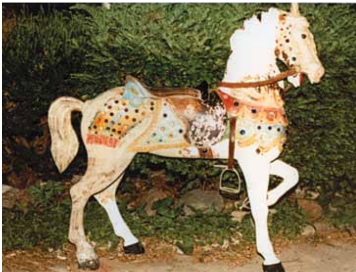
Middle-row 1907 Borrelli-Carmel showing original paint on trappings.

With our active family, I found that spare time was priceless, and I wasn't rich. When I was getting a group of horses ready for a display, I knew I didn't want to show the horse half-stripped. Making a poor decision, it was stripped to the bare wood, but first I took a photo to document the original colors. Then he spent four months with nine of our other horses on loan to the Waukesha County Museum to celebrate the re-opening of a large display area. The exhibit was educational, and this Carmel represented the inner-row Coney Island style.