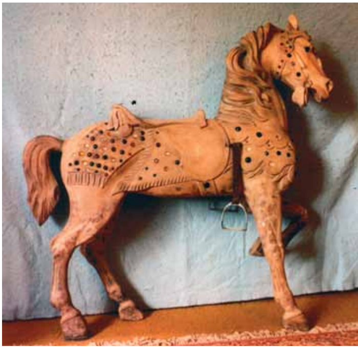
1907 middle-row Borrelli-Carmel stripped.

York and New Jersey area who had photographed this carousel, but no one had a photo showing our horse in the middle row. I finally gave up.