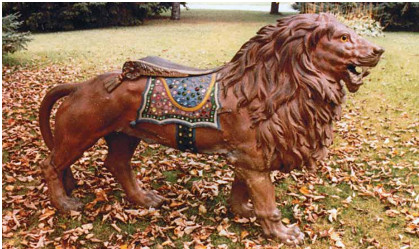
Loeff lion in the front yard.